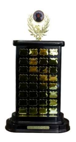
Champion Bird In Show